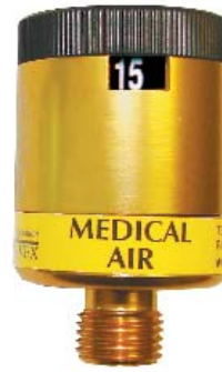
Medical Air Dial Flowmeter