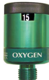
Oxygen Dial Flowmeter