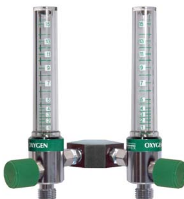
Dual Flowmeter Assembly