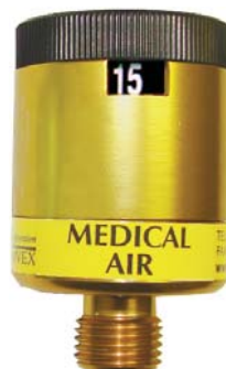
Medical Air Dial Flowmeter