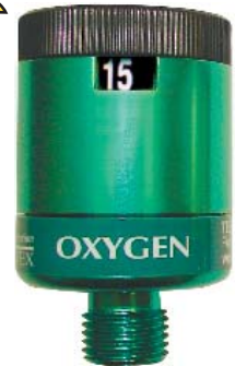
Oxygen Dial Flowmeter